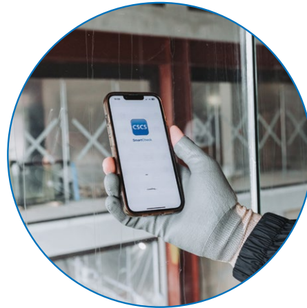
Download the app

Only a scan via the CSCS Smart Check app, website or API within an existing site system will verify that individuals working on a construction site have the appropriate training and qualifications for the job they do.