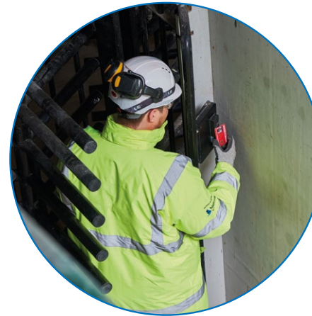
An API for existing site systems