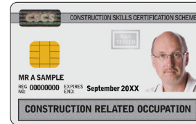
Construction Related Occupation (CSCS stopped issuing this card from April 2017)