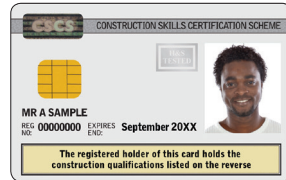
Academically Qualified Person