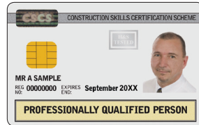
Professionally Qualified Person