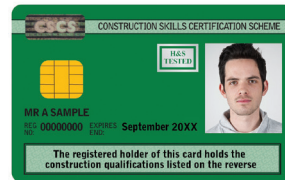
Basic Skills (CSCS stopped issuing this card from 3rd September 2018)