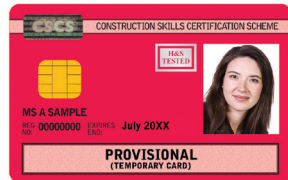
Provisional (temporary card)

Most card applicants must pass the relevant CITB Health, Safety and Environment Test.