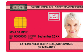
Experienced Technical, Supervisor or Manager