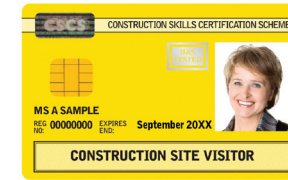
Visitor (CSCS will stop issuing this card from 31st August 2020)