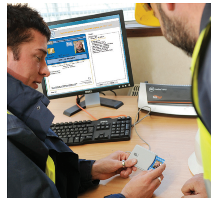
CSCS card check using card reader connected to a PC or laptop