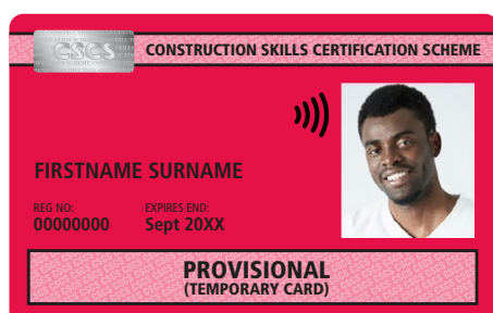
Provisional (temporary only)