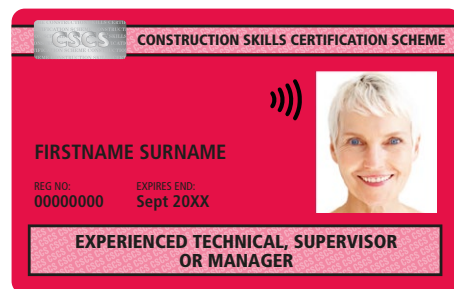
Experienced Technical, Supervisor or Manager