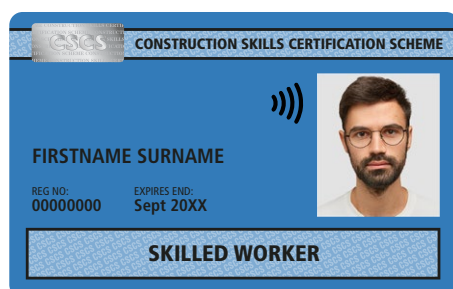
Blue Skilled Worker