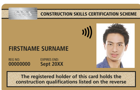
Gold Skilled Worker