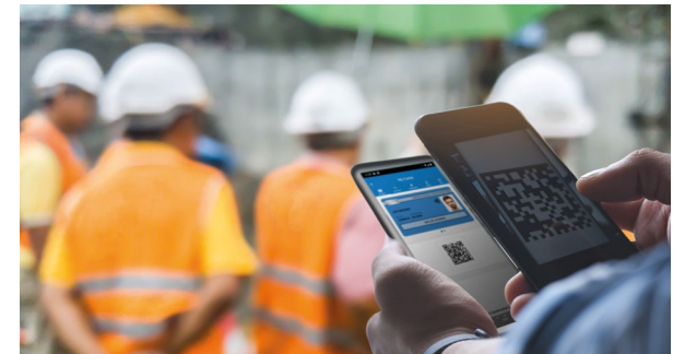
All 2.1 million cards in the construction industry displaying the CSCS logo can be verified using CSCS Smart Check

CSCS Smart Check was launched by the CSCS Alliance in April, – allowing all 2.1 million cards in the construction industry displaying the CSCS logo to be verified using a single app for the first time.