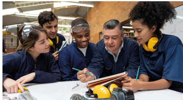
CSCS made the key step of making Apprentice cards free of charge

At the same time CSCS introduced a new process for anyone experiencing difficulties with their apprenticeship registration. In this scenario, the new entrant can apply for the Provisional