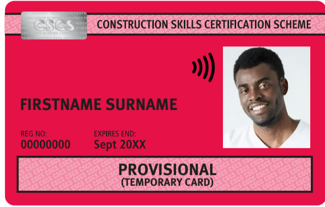
PROVISIONAL (temporary only)