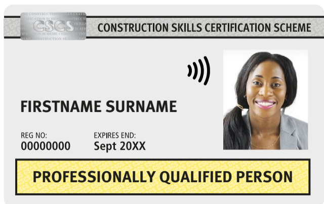
PROFESSIONALLY QUALIFIED PERSON