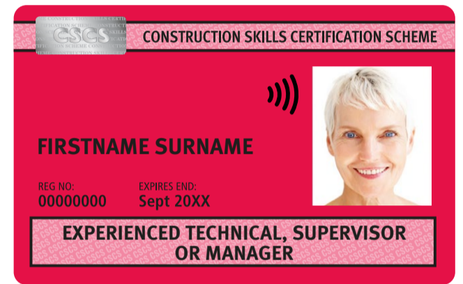
EXPERIENCED TECHNICAL, SUPERVISOR OR MANAGER