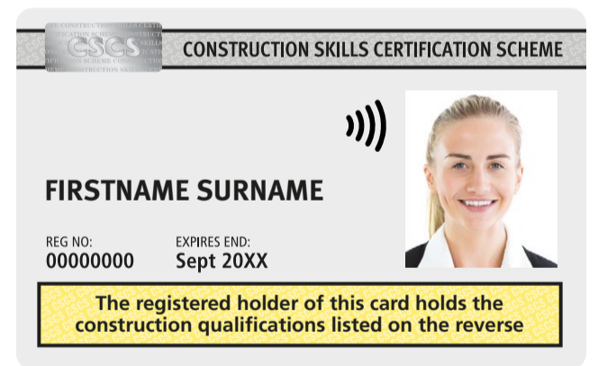
ACADEMICALLY QUALIFIED PERSON